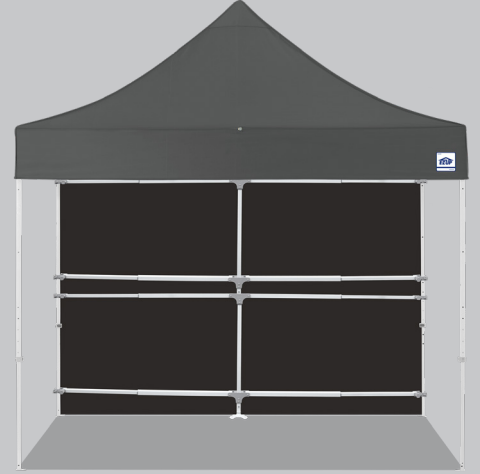
CANOPY AND SIDEWALL NOT INCLUDED